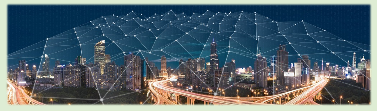
Newsletter No.7, August 2022