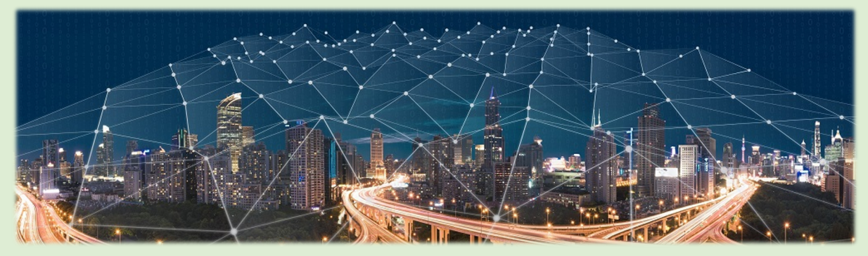
Newsletter No.7, August 2022

The Sweden-China Bridge project, funded by The Swedish Transportation Administration (Trafikverket, TRV), formally started on the 1st of September 2020.