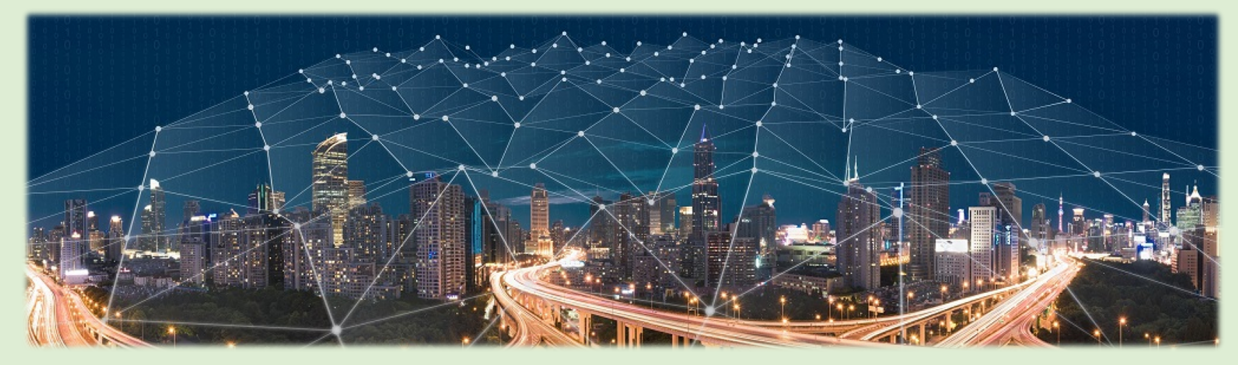
Newsletter No.7, August 2022