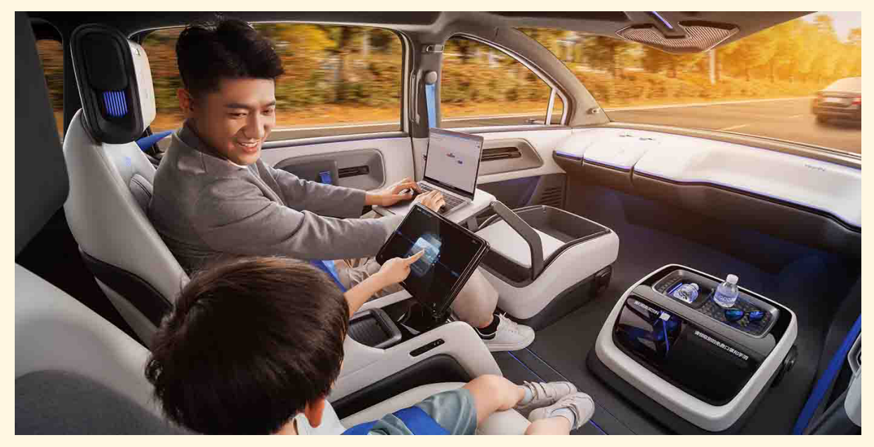
Photo 3: Baidu Apollo RT6 Level 4 autonomous robotaxi with detachable steering wheel

• Interactive lights indicate key signals for communicating with passengers and other cars on the road.