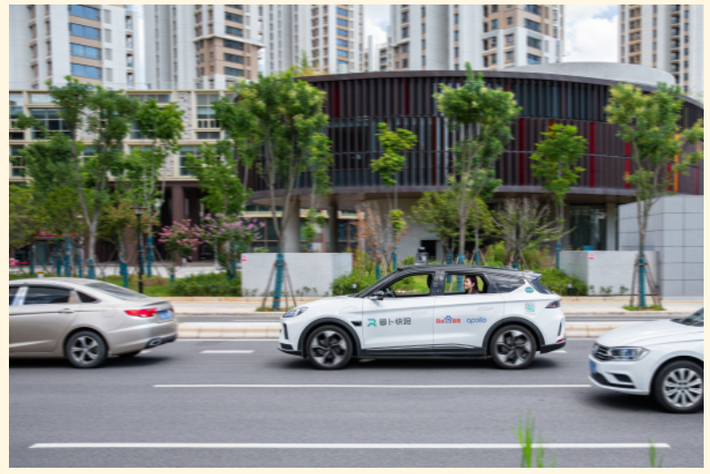
Photo 1: Baidu Apollo RT6 passenger car. Baidu " Apollo Go " launched an unmanned service in the economic development zone in Wuhan city.

With the implementation of this policy, the residents of Wuhan and Chongqing will be the first to enjoy driverless travel services in China. It will also usher in a turning point of rapid growth and put the country in a leading position in global competition. In the autonomous driving industry, real operation data forms the basis for driving the technology from written on paper to implementation in practice<sup>i</sup>.