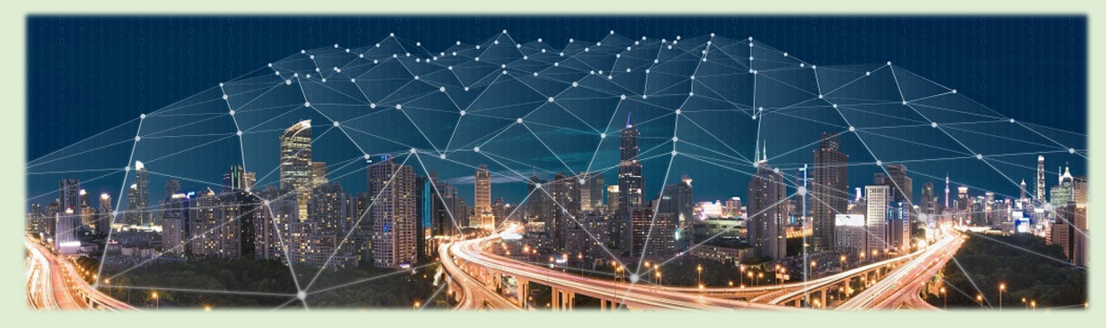
Newsletter No.7, August 2022