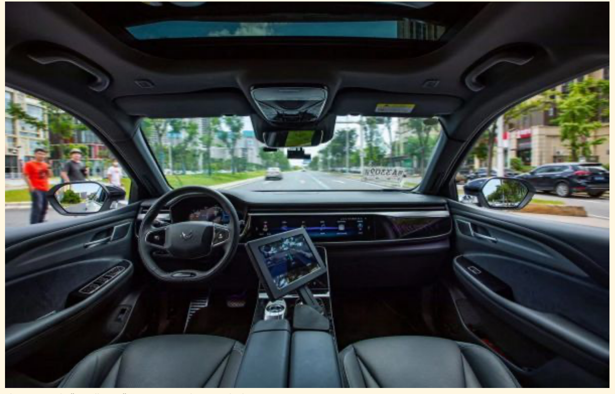
Photo 2: Baidu " Apollo Go " autonomous driving vehicle view.

This development in the cities of Wuhan and Chongqing is only the start of empirical large-scale testing and development of autonomous driving on level 4. We have reason to believe that more cities will follow, and later level 5 will also be introduced.